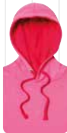
Candyfloss Pink/ Hot Pink