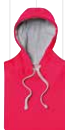
Hot Pink/ Heather Grey*