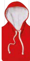
Fire Red/ Arctic White