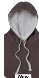
New Charcoal/ Heather Grey