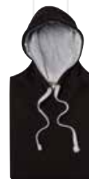
Jet Black/ Heather Grey*Δ†