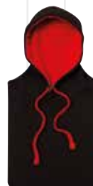
Jet Black/ Fire Red*Δ†