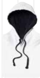
Arctic White/ French Navy