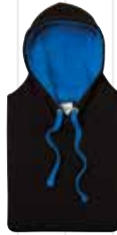
Jet Black/ Sapphire Blue*