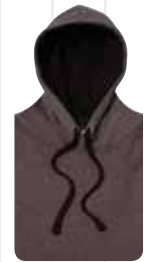
Charcoal/ Jet Black*