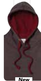
New Charcoal/ Burgundy/