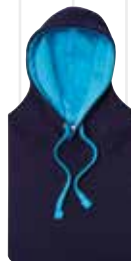
Oxford Navy/ Hawaiian Blue