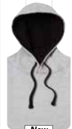
New Heather Grey/ Jet Black