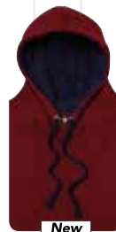
New Burgundy/ Oxford Navy