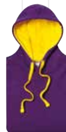
Purple/ Sun Yellow*