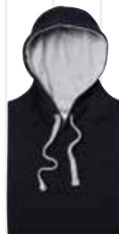
New French Navy/ Heather Grey*Δ†