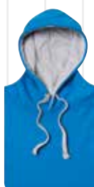
Sapphire Blue/ Heather Grey*