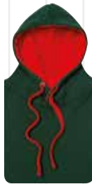
Bottle Green/ Fire Red