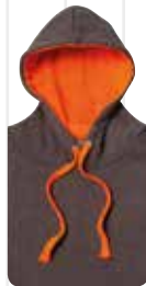
Charcoal/ Orange Crush