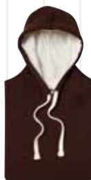
Hot Chocolate/ Vanilla Milkshake