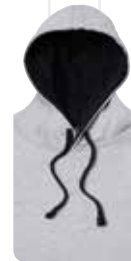
Heather Grey/ French Navy*Δ†