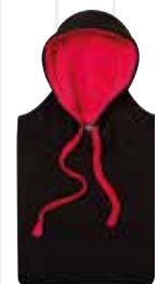
Jet Black/ Hot Pink*