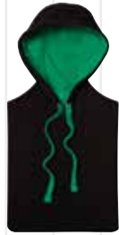
Jet Black/ Kelly Green*