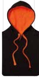
Jet Black/ Orange Crush*