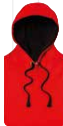
Fire Red/ Jet Black*