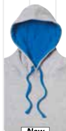
New Heather Grey/ Sapphire Blue