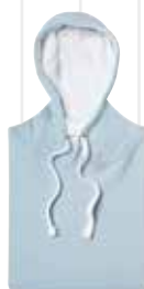
Sky/ Arctic White