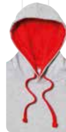
Heather Grey/ Fire Red*