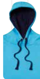
Hawaiian Blue/ Oxford Navy