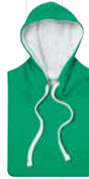
Kelly Green/ Arctic White