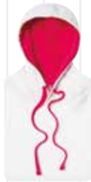
Arctic White/ Hot Pink