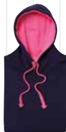
Oxford Navy/ Candyfloss Pink