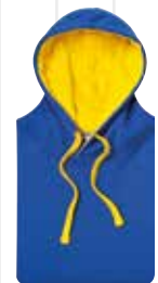
Royal/ Sun Yellow*