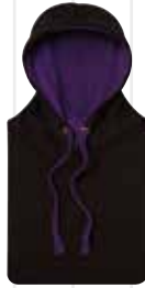
Jet Black/ Purple