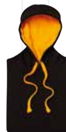
Jet Black/ Gold*†