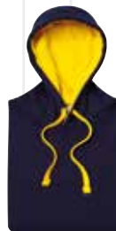
Oxford Navy/ Sun Yellow