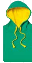
Kelly Green/ Sun Yellow