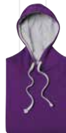
Purple/ Heather Grey