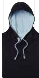
New French Navy/ Sky Blue*