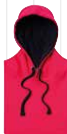
Hot Pink/ French Navy*