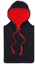
New French Navy/ Fire Red*†