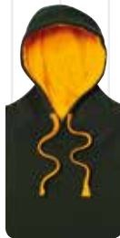
Forest Green/ Gold