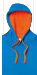
Sapphire Blue/ Orange Crush*