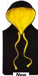
New Jet Black/ Sun Yellow