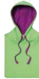
Lime Green/ Magenta Magic