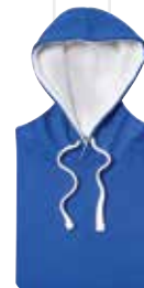
Royal Blue/ Arctic White*