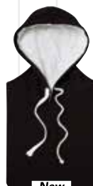
New Jet Black/ Arctic White