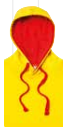
Sun Yellow/ Fire Red