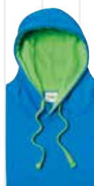
Sapphire Blue/ Lime Green